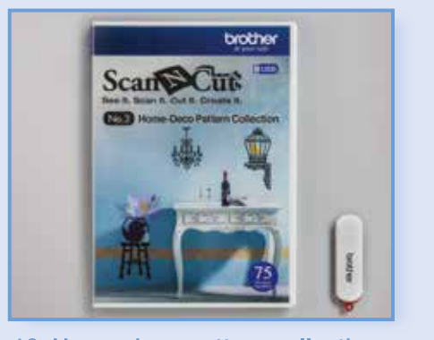
10. Home-deco pattern collection