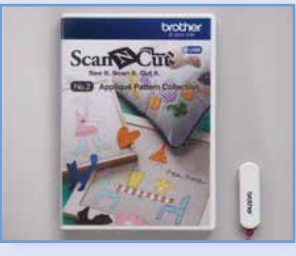
9. Appique pattern collection