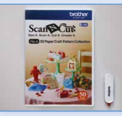
11. 3D paper craft pattern collection