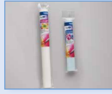
4. High tack fabric support sheet