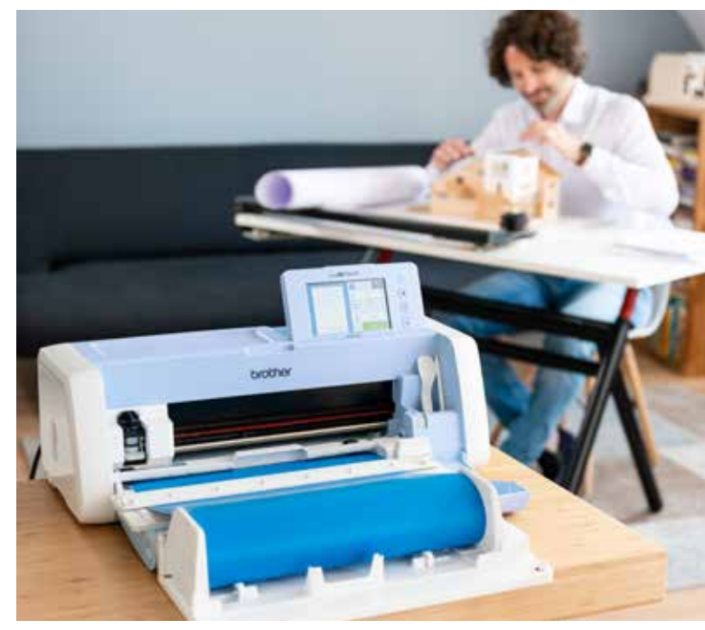
Matt-less loading for Roll Stickers* With the roll feeder function, you can now load and cut rolled sticker material without the need for a mat. *Additional purchase of roll feeder necessary. CanvasWorkspace (PC version) is necessary to be installed when you use Roll Feeder function

Expand your creative possibilities with the optional Roll Feeder. Great for creating longer designs for home décor, shop windows and high volume cutting of repeat jobs like stickers or logos.