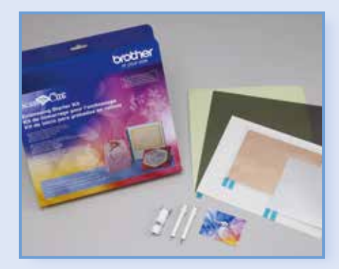
6. Embossing kit