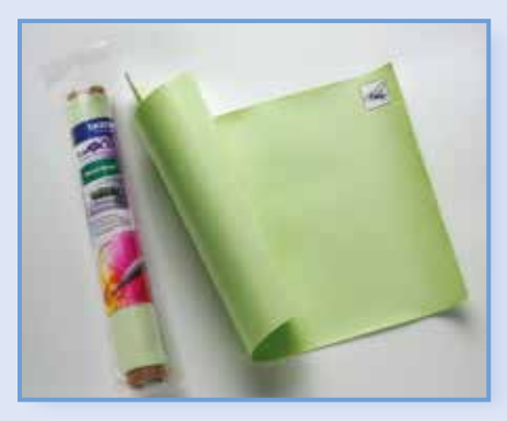
5. Stamp starter kit