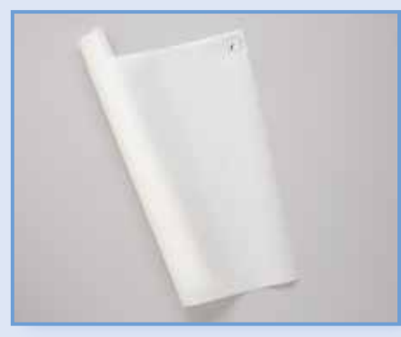
3. Iron-on fabric applique contact sheet