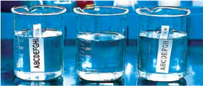
Water and Chemical Resistant

After laminated labels were placed in a fade-inducing chamber to simulate a year in sunny surroundings, the text was unaffected.