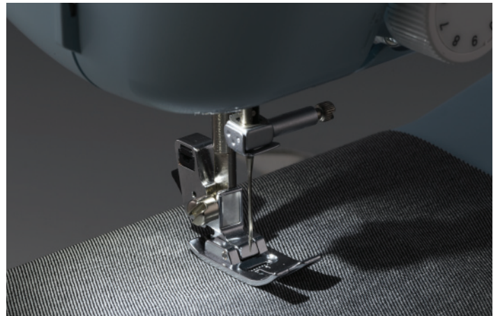
LED lighting for easy viewing