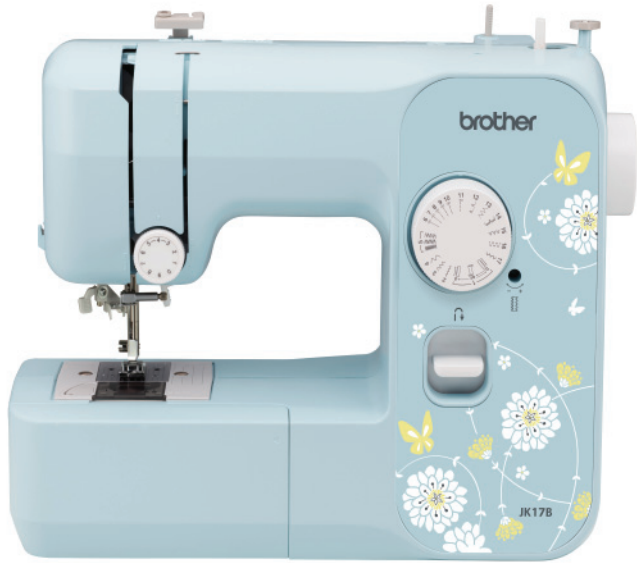
JK17B 17 Stitches